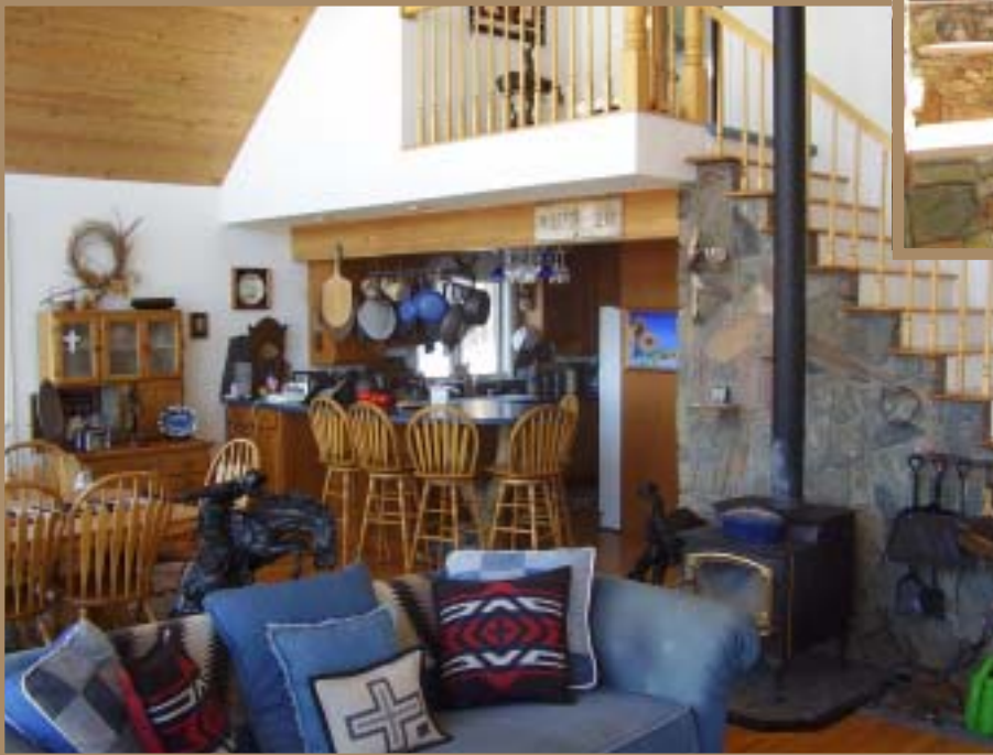
Living Area & Kitchen