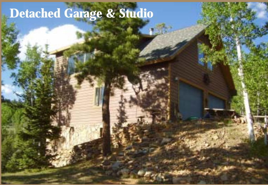
Detached Garage & Studio